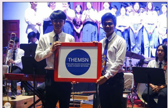
SUMHUA Concert #2 at Bansomdejchaopraya Rajabhar University on 15th March 2020