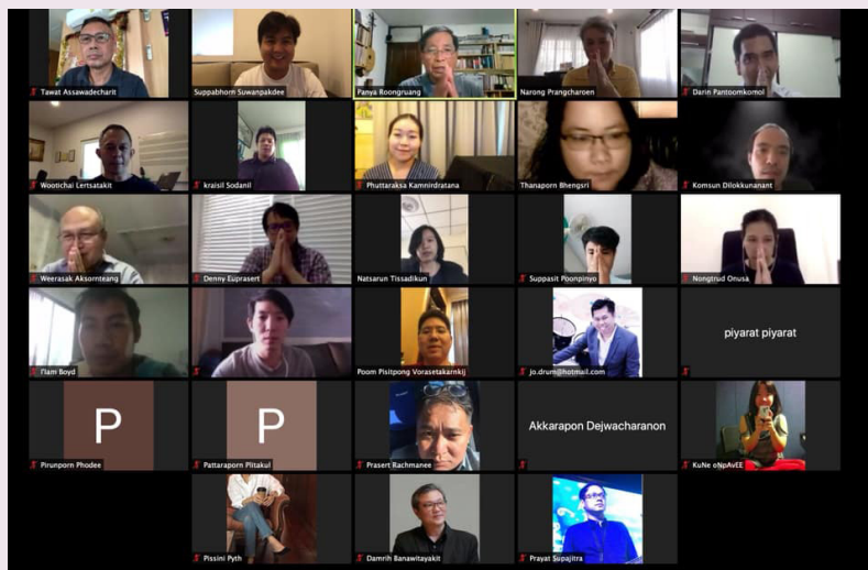
THEMAN's meeting 1/2020, online session on 4th April 2020