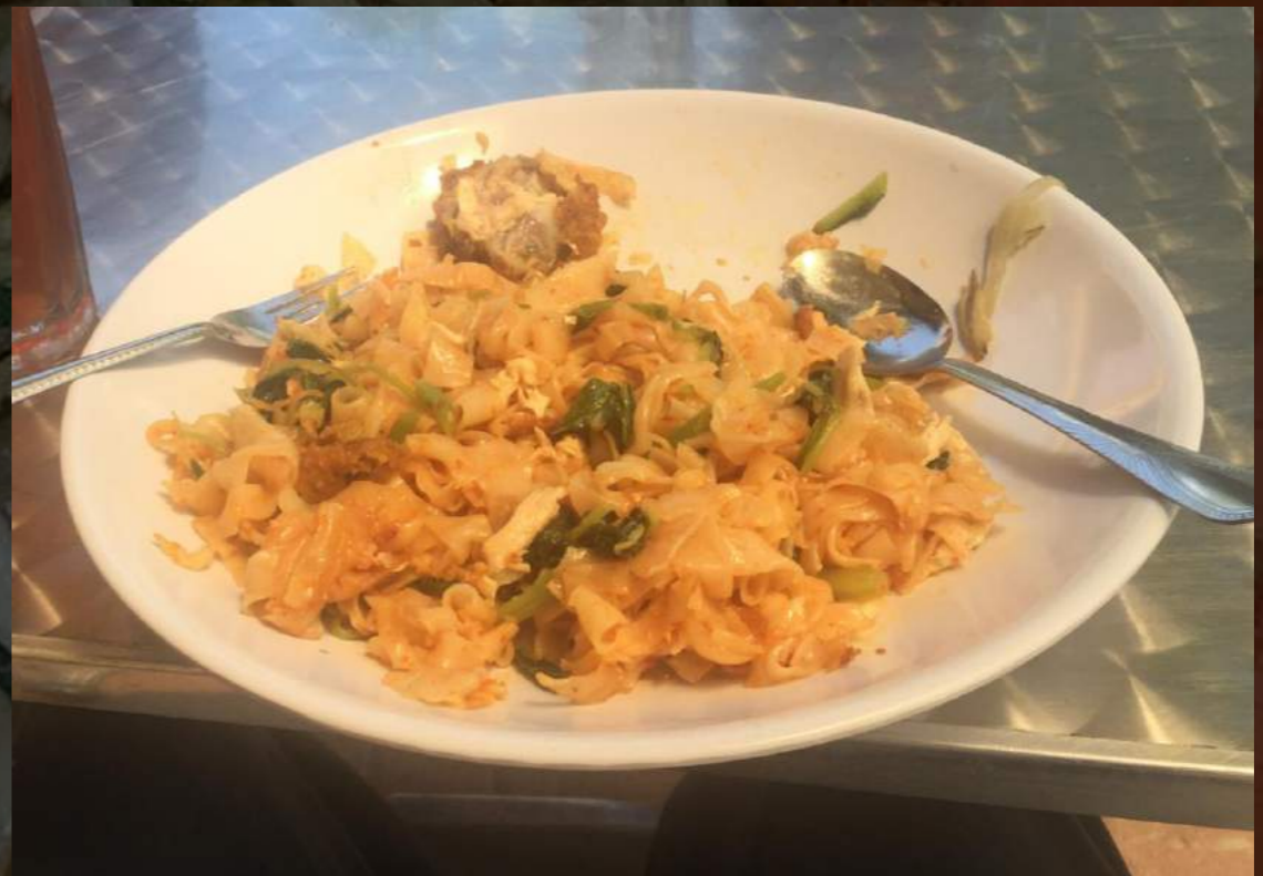
Char Kway Teow (Malay style) UPSI Cafe